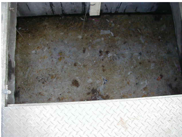
Grease Blanket Before Treatment