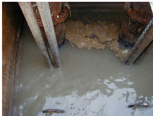
No Grease During Treatment

Visit our website at http://www.premierchemicals.com for more information, or contact us at 800-227-4287.